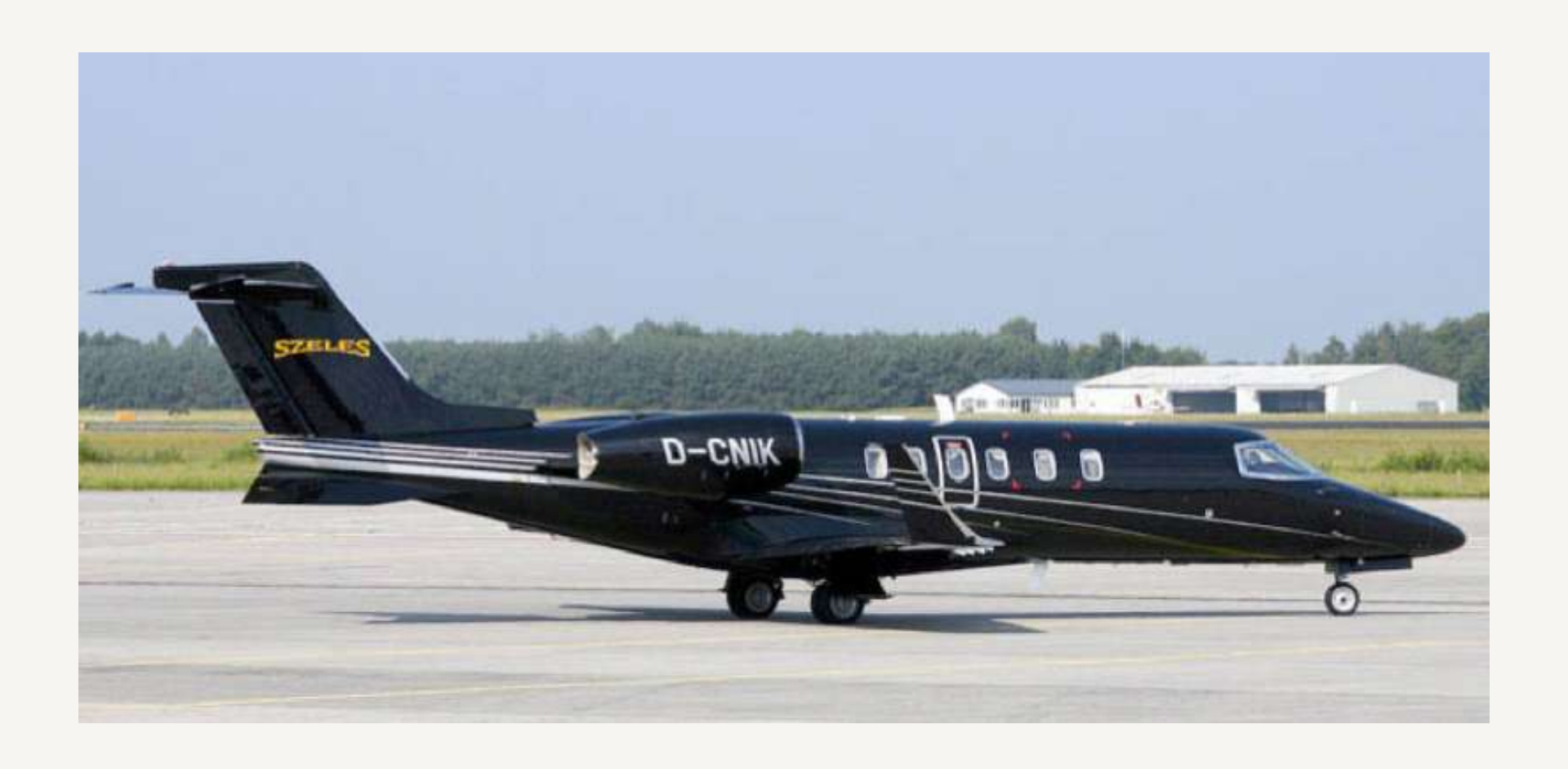
Any time. Any place. Any where.